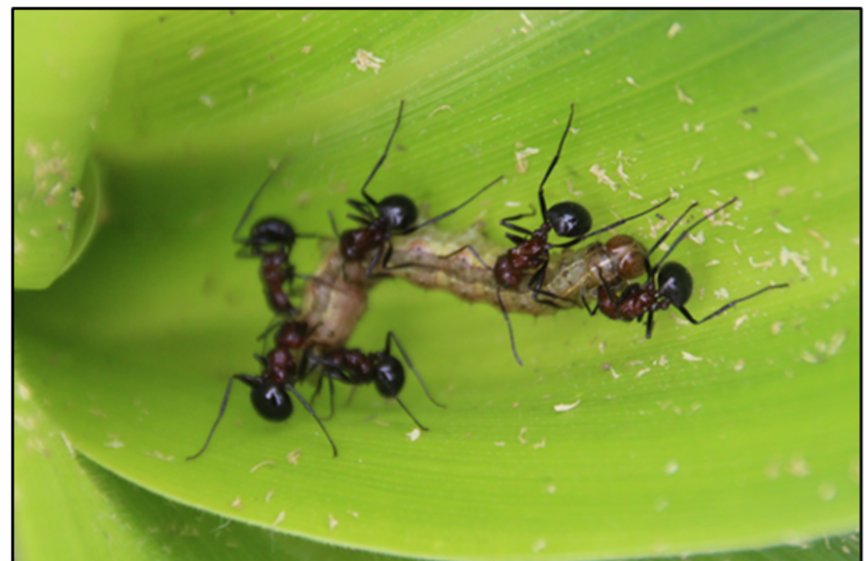
Chithuzi: Gulu la nyerere kupenja Kapuchi mu ngoma.

Vilwani vya chilengiwa ni vibenene ngeti wabingiza wakupenjapenja, mitatavu, nyerere na masanganavu. Vikulya olo panyake kutayila masumbi ya mu vibungu ngeti wabongololo, magengena, nyinda na vibenene ivyo vikukhala mu mahamba. Kugwiriska ntchito mankhwala ya chizungu yangakoma vilwani vya chilengiwa ivi kweniso na vibungu ivyo vingapangiska kuti suzgo la vibenene liwe lakusuzgilapo chomene mu nyengo zinyake.