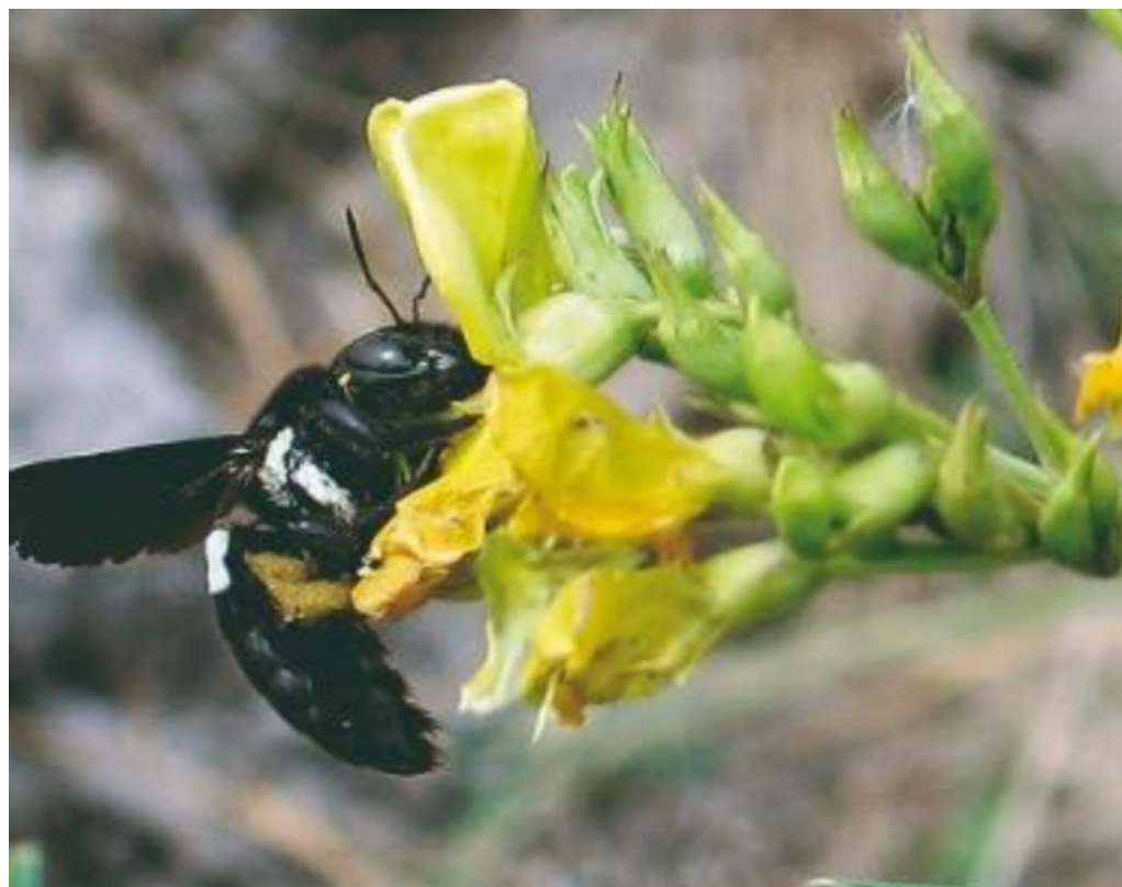
Chithuzi: Zoli yikumwa shuga kufuma ku luwa la nyamundolo.

Vibungu vyakukwatiska mbeu ni vibenene ngeti njuchi, bulawula na wazoli. Vikwiza pa maluwa na chakulata chakuti vizakamwepo shuga panyake kuzakatolapo ufu wakukwatiskira. Pala vikwenda kufuma pa luwa limoza kuluta pa linyake, vikuyeya shuga na ufu wakukwatiskira mbeu. Ku mbeu izo zikupasa maluwa, ivi vikukhumbikwa chomene kuti mbeu izi zipambike vipaso na mbeu: ndondomeko iyi ndiy yikuchemeka kuti kukwatiska. Kwambula kukwatiska, mbeu zinyake ngeti majungu yangapambika vipaso yayi.